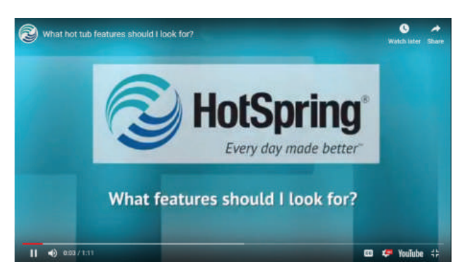
Watch the video below to learn more.

Everyone's looking for a spa that's convenient to use, easy to maintain, and cost-efficient — but what about the personal details that make it yours? With most models, you can choose the color of the shell, cabinet, and cover. You can also customize your spa experience by choosing entertainment options and other accessories. So, before you buy, consider the features that are must-haves to make your hot tub dream a reality.