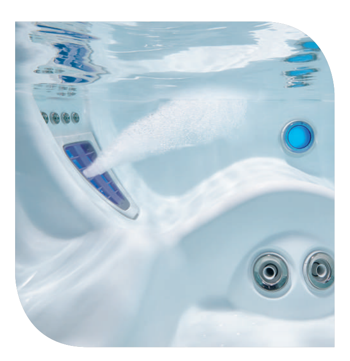
Moto-Massage<sup>®</sup> DX Jet exclusively available in Highlife<sup>®</sup> Collection spas.

Above-ground hot tubs generally feature anywhere from 20 to 100 jets <u>targeted to</u> <u>certain muscle groups</u> to help you relax and emerge from your spa feeling your best. When comparing models, look for powerful, patented jets that will provide the type of massages your body needs. Also look for targeted jet groupings. More jets doesn't always mean a better experience. Often, fewer jets in targeted groups will provide a better, more focused massage. Jet groupings can also help conserve energy.